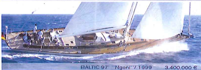
BALTIC 97' "Ngoni" / 1999 3.400.000 €

The aim is to provide the existing customers and the perspective clients a full yacht lifecycle service with commitment and professionalism. It ranges from Sales & Purchase, project management to owners representation during building and refit of the purchased yachts.