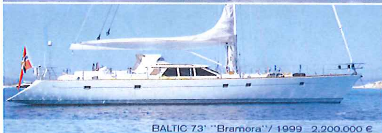
BALTIC 73' "Bramora" / 1999 2.200.000 €