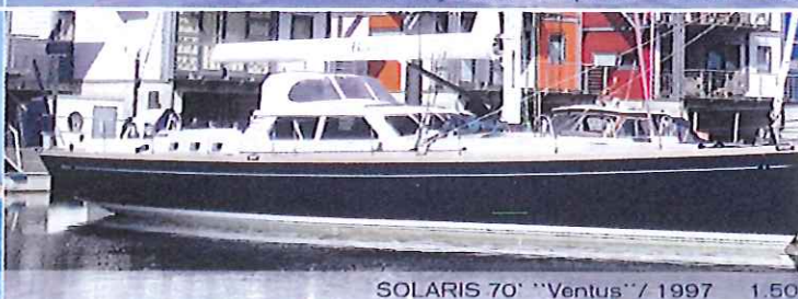
SOLARIS 70' "Ventus" / 1997 1.500.000 €

judel/vrolijk & co ENGINEERING ■ DESIGN ■ BROKERAGE