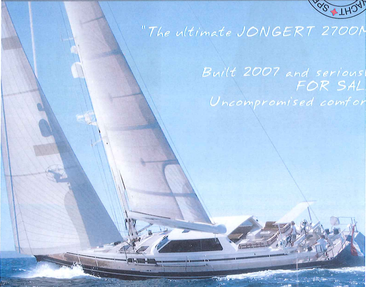
Bay of Palma de Mallorca Sept-18th, 2013. 10 knots boatspeed @ 14-15 kn windspeed

Built 2007 and serious FOR SALE Uncompromised comfort