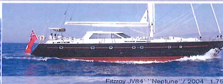
Fitzroy JV84' "Neptune" / 2004 1.750.000 €